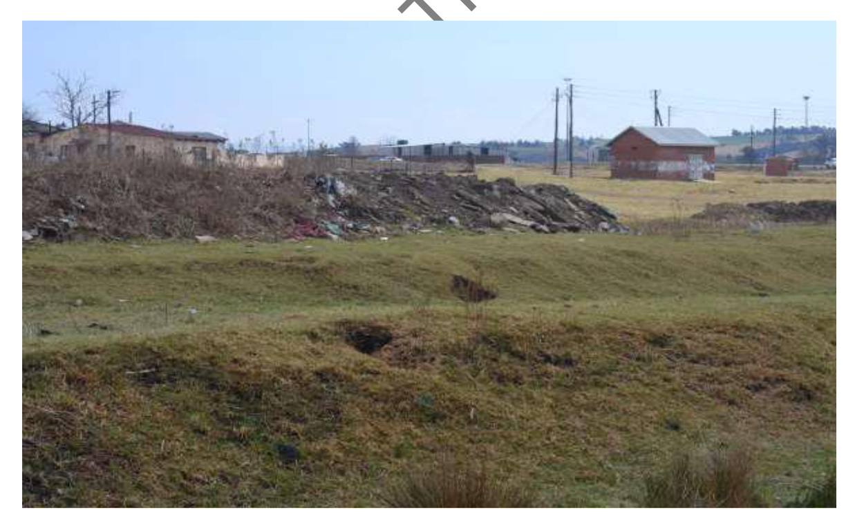
Figure 5: A view from the community into the wetland, with the spoil material in the centre foreground.