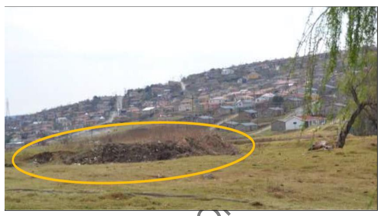
Figure 4: The spoil pile onto which the rock and soil from the excavation was deposited.

The contractor disposed approximately 80m³ of spoil material from the excavation for the pipeline into the Bruntville wetland following a request from the landowner. The spoil material was deposited in a pile approximately 3m in height, as shown Figures 4 and Figures 5 below. A close-up view of the spoil material is shown in Figure 6 .