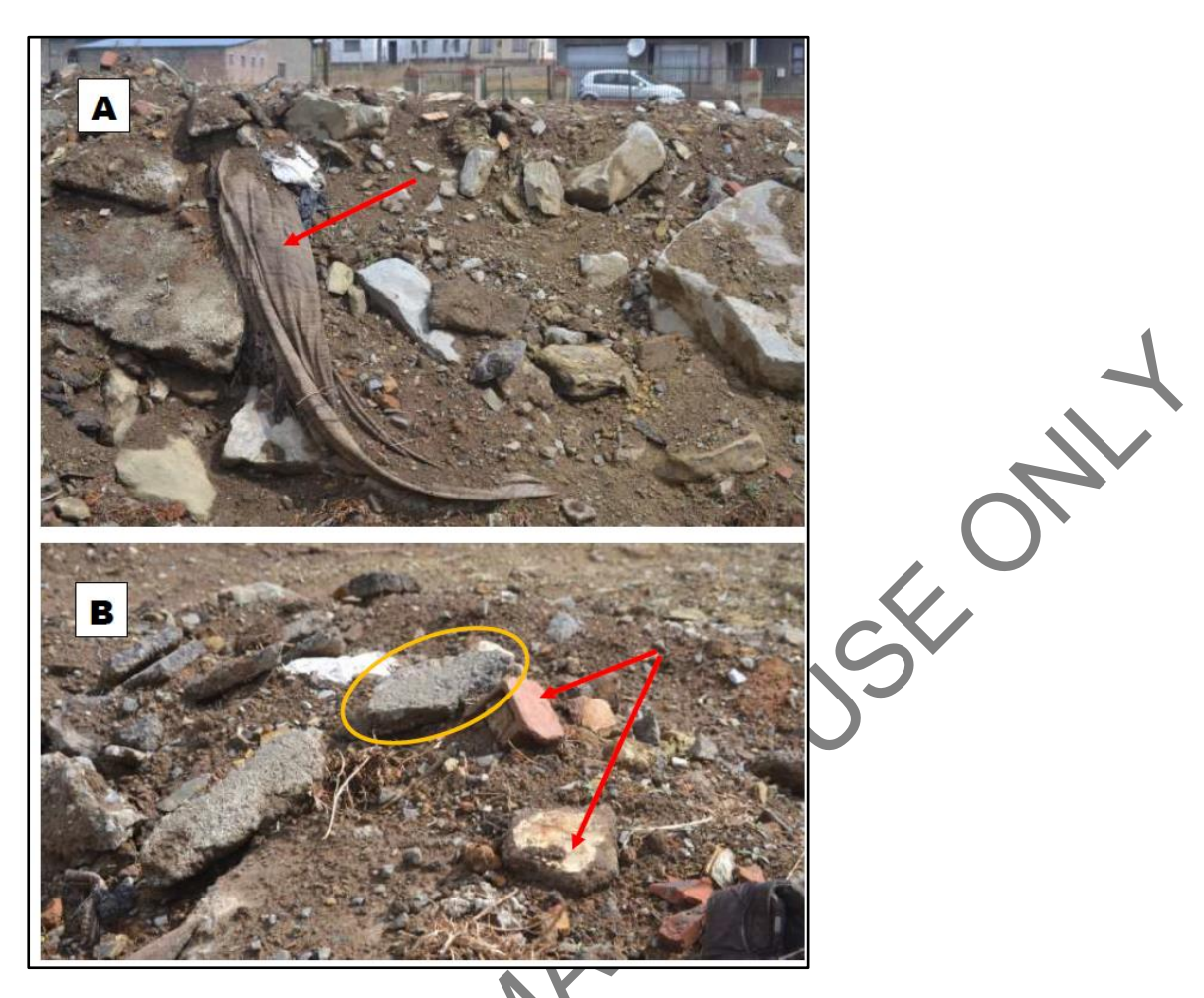
Figure 6: A close-up view of the fill material.