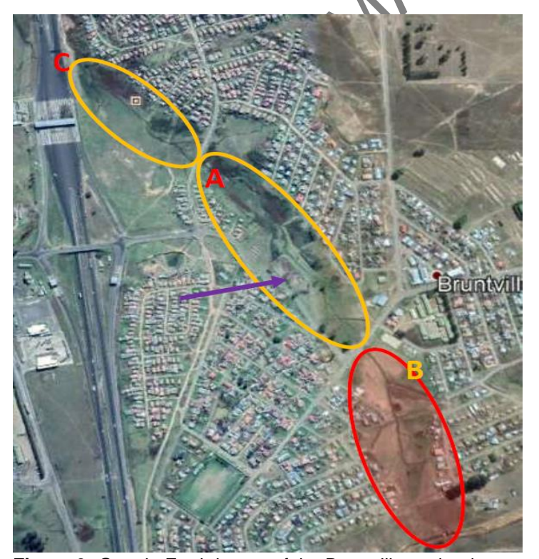
Figure 3: Google Earth image of the Bruntville wetland system.